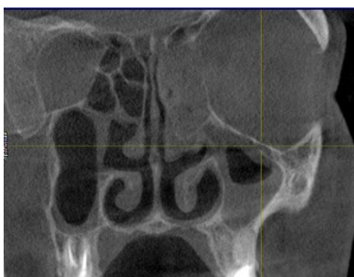
Figure 1. Patient D., 31 years old. 3D radiography of the paranasal sinuses. Identification of subtotal and total areas of blackouts in the left maxillary sinus and ethmoid cells