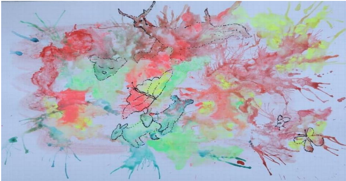
Figure 1. Isotherapy. A creative example of students of Yeosu Technical Institute in Tashkent

Another common method of art therapy is mandala therapy. A mandala is a picture inside a circle. The circle reflects a person's lifestyle, interaction with the environment. This method helps the patient to understand himself, get rid