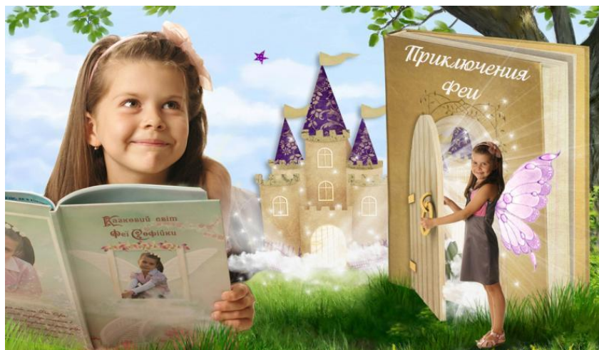
Figure 3. Fairy tale therapy

overcomes various fears and finds answers to many questions that they cannot explain to adults. It can also be said that children imitate their favorite fairy tale characters, they also love to draw and color their pictures. This forms positive qualities in them [2].