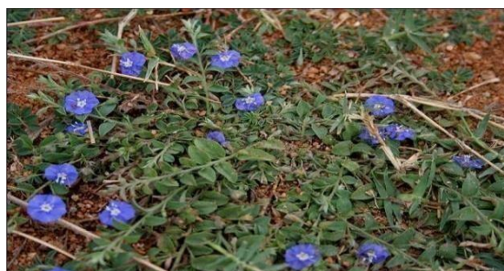
Figure 1: Evolvulus Alsinoides