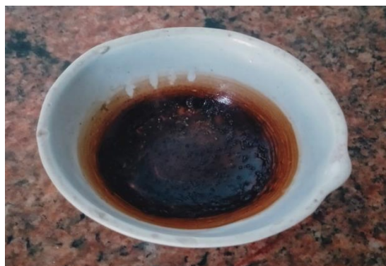
Figure 2: Aqueous Extract of E. Alsinoides

What'smann filter paper No.1 into a beaker. Filtrate was evaporated at 40°C on a water bath to obtain the solid crude extract.