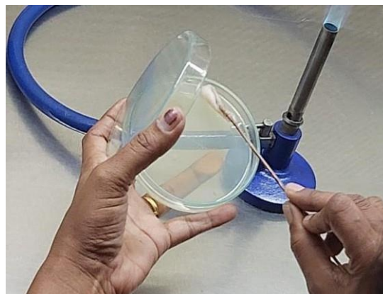
Figure 6: Lawn Culture

on the solid medium using a cotton swab. Lawn culture provides a uniform surface growth of the bacterium.