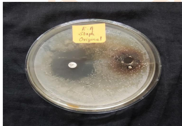
Figure 7: Zone of Inhibition Against S. Aureus