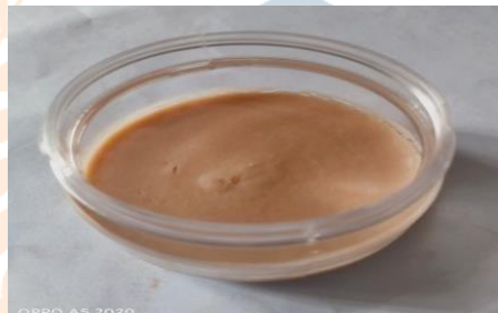
Figure 3: E. Alsinoïdes Cream

homogenous product is formed. Bees wax and liquid paraffin are melted to 75°C in a beaker by stirring. This is the oil phase. In another beaker borax and water are taken and heated to same temperature as the oil phase. Plant extract is added to the aqueous phase and mixed well. Aqueous phase is added to the oil phase and stir continuously until a homogenous product is formed. Finally, perfume is added and packed in a suitable container.[28]