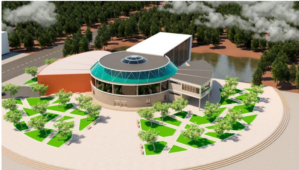
Figure 2. Cultural and educational center building.