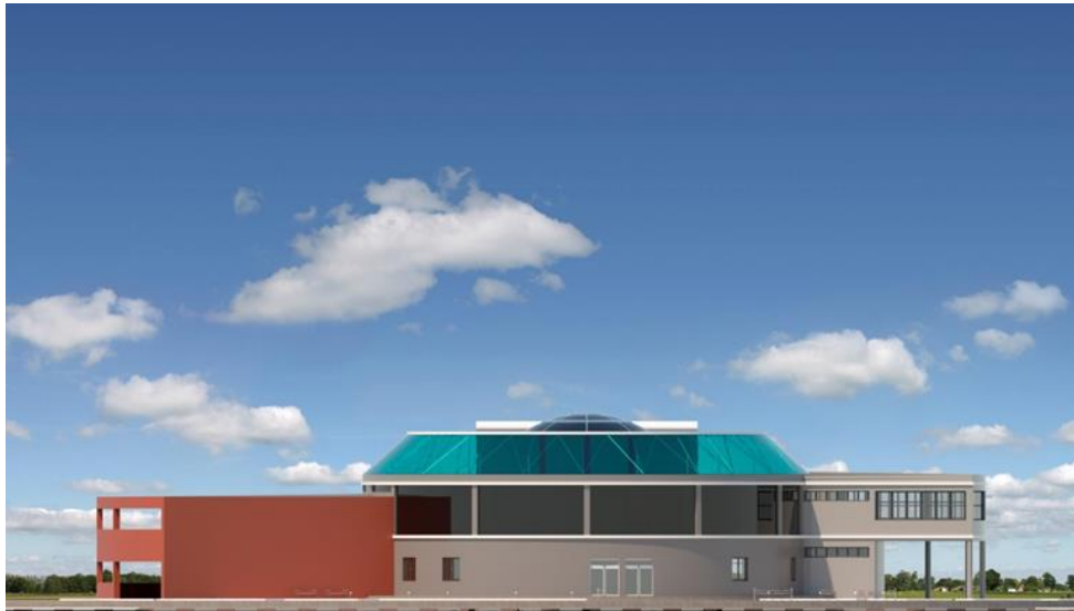
Side view of the building