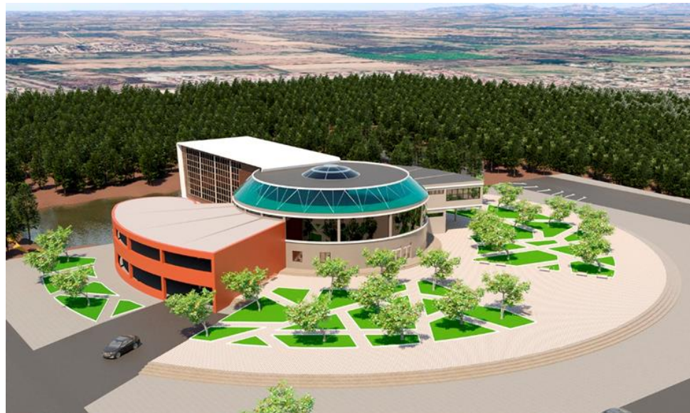
Figure 3. Cultural and educational center building.