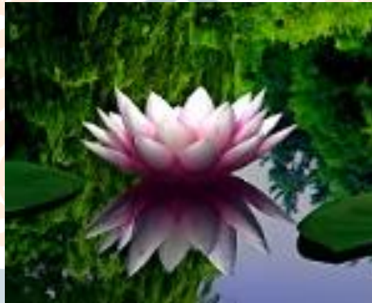
Figure 1. Nilufar. A symbol of divine beauty in India

strong creative power. In Indian literature and Indian poetry, the lily is the standard of beauty. Lily flowers are one of the main symbols in Hindu iconography. Since the shape of the lily is circular, it is a sign of growth, ascension. And the leaf is like sunlight. In particular, the Egyptian lily leaf was recognized as a symbol of goodness, light and love. It is the source of divine life. Its seeds represent the source of reproduction, birth, and growth in ancient Egypt, India, China, and Japan. In the east, the lily represents the center of the universe.