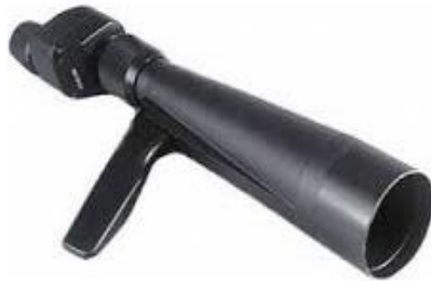
Figure 3. ZRT-460 sight tube

measurement from 10 m to infinity focuses on long objects (set to tension) by rotating the applied ring. The diopter is mounted on the eyepiece to adjust the tracking contrast.