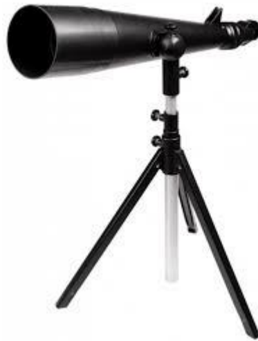
Figure 1. ZRT-457 sight tube

The optical circuit of the ZRT-457 tube consists of a prism wrapping system and a two-lens lens with a five-lens eyepiece.