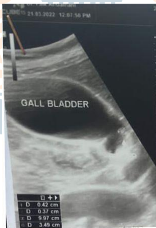
Figure-2: Abdominal ultrasound showed small polyp in the gall bladder