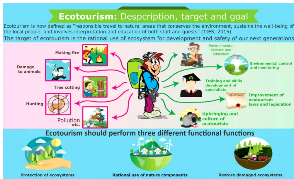
Figure 2. The concept, purpose and functions of ecotourism

movement and innovation; are distinguished by the nature.