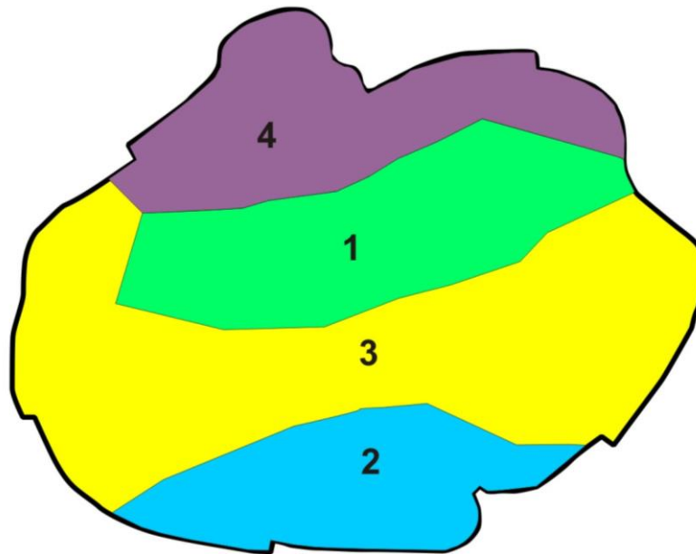
Figure: 1. Scheme of dividing the working area of the Muruntau open-pit mine into active and passive parts: 1 - non-working open-pit side; 2 - temporary rear sight; 3 - the main working area; 4 - "North Board".

direction of the western and eastern flanks, as well as in depth (Fig. 1).